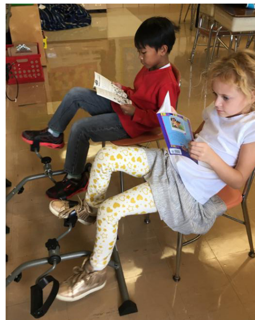
Club FitLit students pedaling and reading

Club FitLit allows students to enjoy reading and other literature activities while staying physically active. They have exercise equipment, are walking daily, and are taking trips to the public library. These grants will cover the cost of the equipment, supplies and transportation.