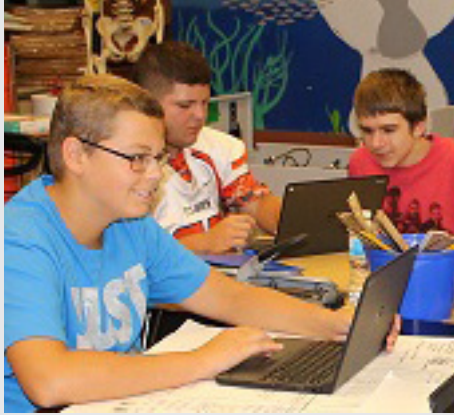
Chromebooks enhance student learning