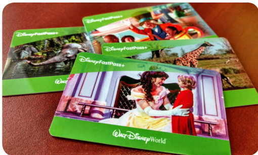
Auction items included Disney Park Hopper Passes.

More than 200 supporters attended the live and silent auction on March 8 at the Crowne Plaza Hotel in Middleburg Heights. They were treated to a buffet where hotel chefs created made-to-order pasta dishes. Volunteers staffed tables filled with nearly 90 auction items. Conducting the live auction was Bob Hale of Benefit Auction Services.