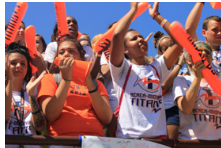
Berea-Midpark High School students celebrating at Titans Day.

Titans Day was the culmination of a community-wide Titans Week involving Berea, Brook Park and Middleburg Heights. Titans Day, Aug. 23, 2013, provided a chance for students and staff to get to know each other through a variety of activities.