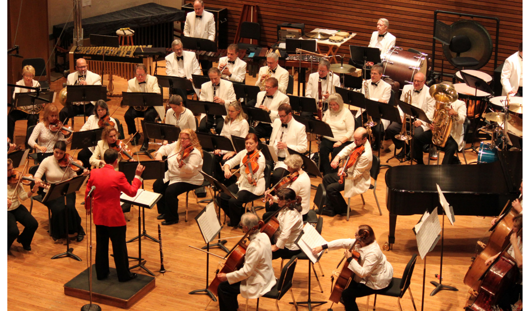
Last year's Cleveland Pops Holiday Concert, benefiting the Education Foundation, was "the perfect way to kick off the holiday season!" Don't miss this year's concert!

"This is a great opportunity for families to enjoy the Cleveland Pops without traveling to downtown Cleveland," said